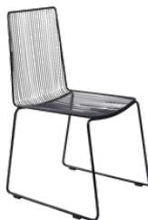
Devonport dining chair

Ico Traders is a proudly carbon-positive company, audited annually. We reduce waste, reuse materials and recycle wherever possible. Our carbon footprint is offset through contributions to Waipuna Bush, helping to regenerate native forest near Christchurch, New Zealand. Steel is a fully recyclable material, when you choose the Dunedin bar-leaner stool, you’re supporting sustainable, timeless design made to last. MEASURE, REDUCE WHAT YOU CAN, OFFSET WHAT YOU CAN’T.