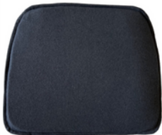
Wool chair pad