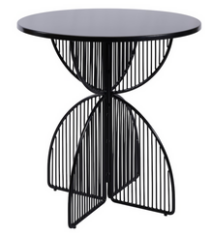
Omaha cafe table

MEASURE, REDUCE WHAT YOU CAN, OFFSET WHAT YOU CAN’T.